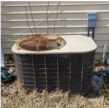
Rusting/Damaged Air Conditioning Units