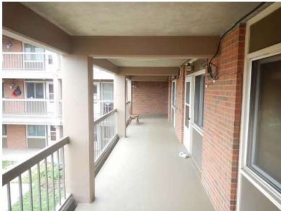
Restored Walkways and Balconies