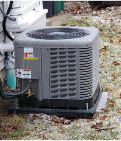
New Energy Efficient Air Conditioning Units