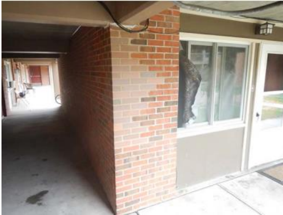
Repaired Brick and Beams