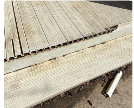
Structural Deterioration of Decks and Railings