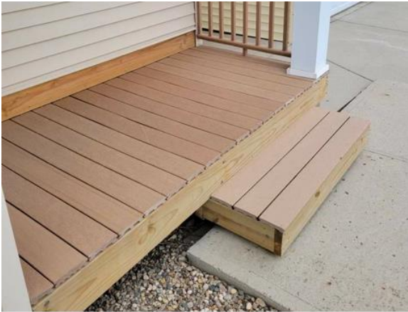
Decks and Railings Replaced